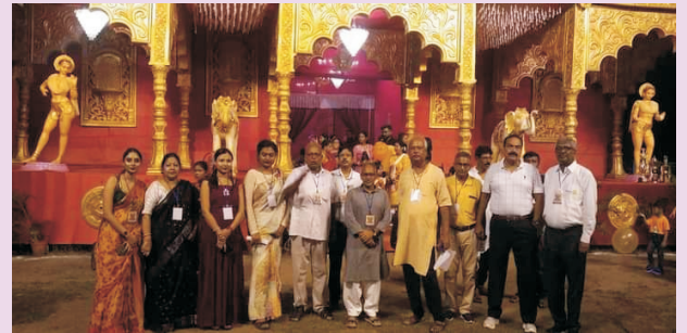
“Sharad Samman” - Puja Parikrama, 2022