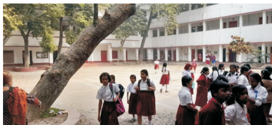
Measles Rubella Vaccination with Madhyamgram Municipality & North 24-Parganas District Health team