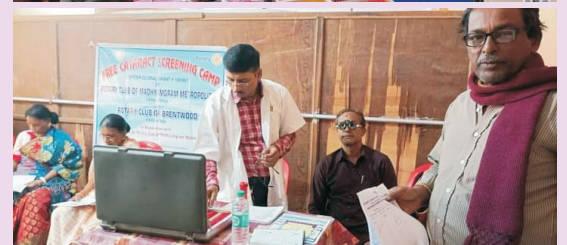
Health Check-up Camp at Hindu Milan Mandir, New Barrackpore & Dum Dum