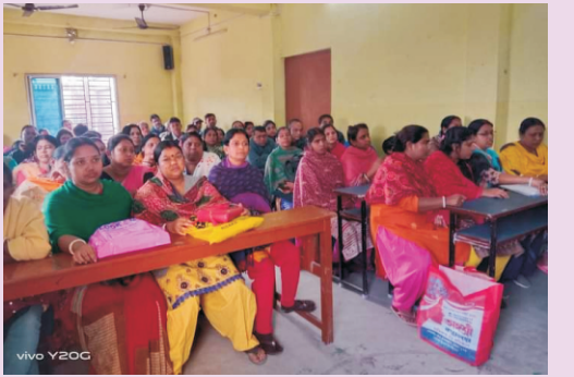
Measles Rubella Vaccination Campaign.